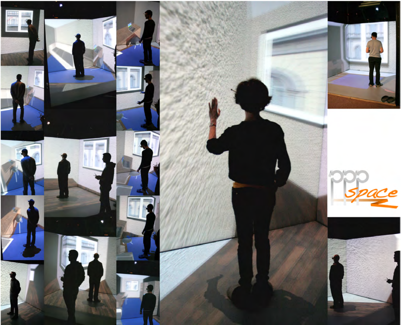
A spatial perception experiment which features the participants in the virtual reality environment of the Icube (EON Icube Emersive Environment - The international Institute for the Advanced Studies of Psychotherapy and Applied Mental Health, Babeş-Bolyai University, Cluj-Napoca, Romania)