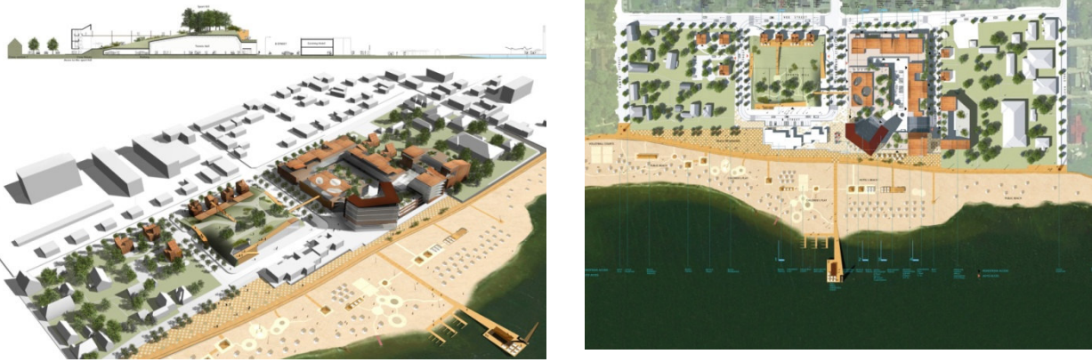
Fig. 3. Second Prize at the International Architectural competition for the spatial planning of the Tamula lakeside area, Voru, Estonia, organized by the Town hall of Voru city and the Estonian Union of Architects, 2008.