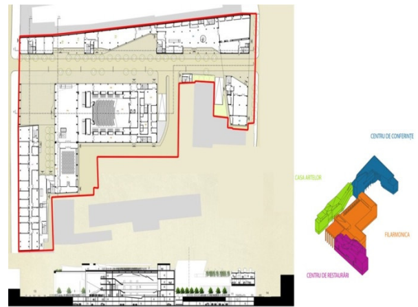
Fig. 4. First Prize at the International competition for the theme of the Cultural Center of Transylvania in Cluj-Napoca, organized by the City of Cluj-Napoca, 2010