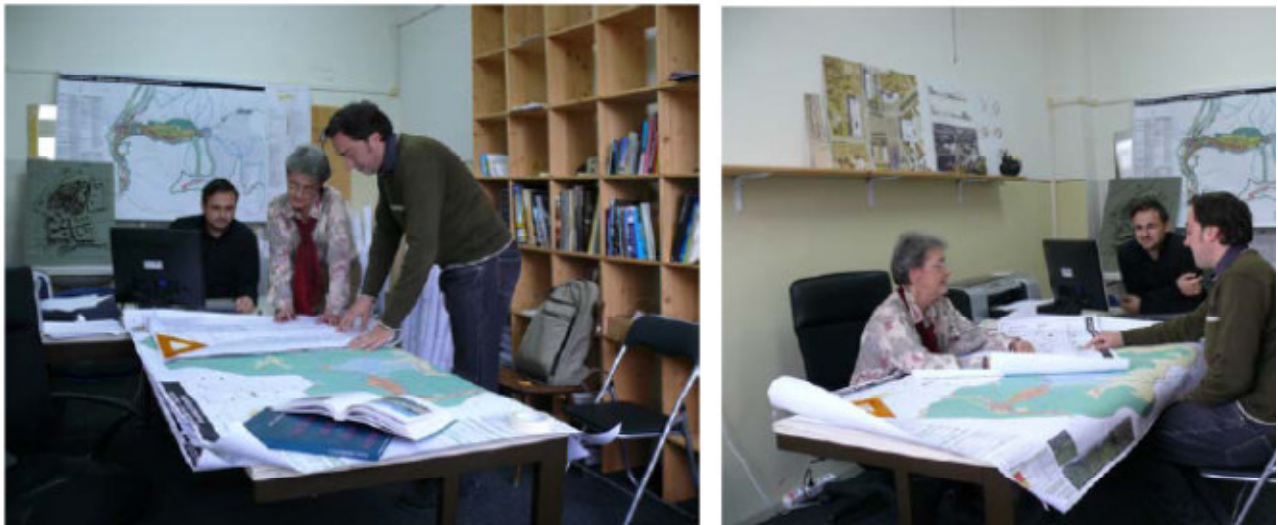
Fig. 1. Images with our team in the research lab

Our group is open to cooperate in interdisciplinary teams for research in urban design and urban planning, at national and international level, with researchers, teachers from universities and with professional associations. The group is able to approach general urban plans, regional urban plans, urban detail plans, plans for territory improvement at different levels and also architectural projects.