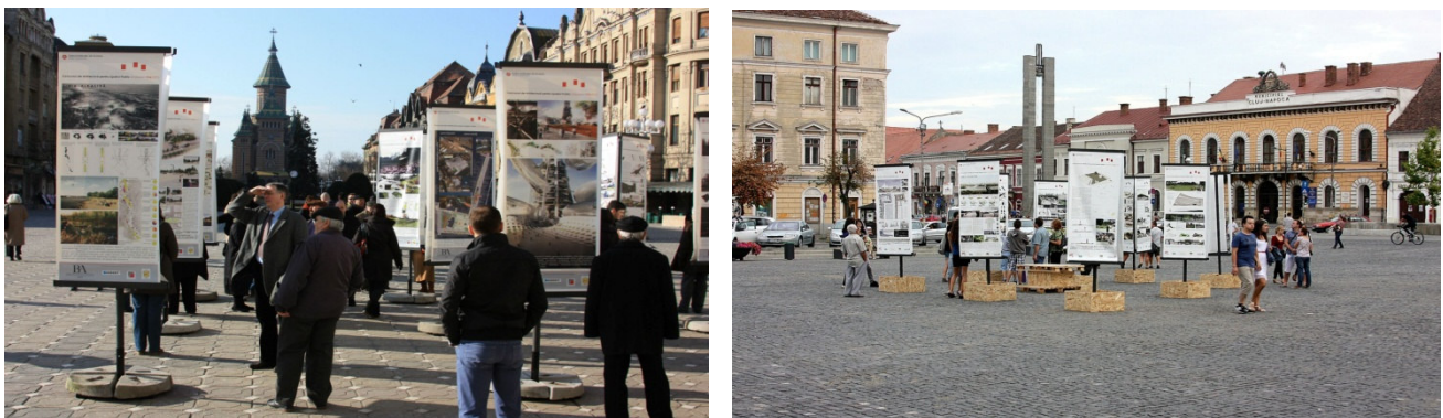
Fig. 2. "Architecture competition for public space" Exhibition organised by Chamber of Architects in Timisoara, Opera Square 2013 (left) and Cluj-Napoca, Unirii Sqare 2012 (right)- participation with International Architectural competition for the spatial planning of the Tamula lakeside area, Voru, Estonia