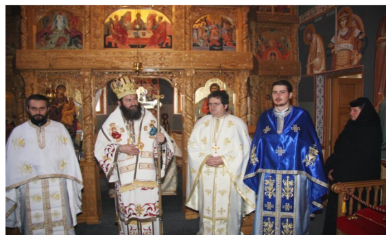
Fig. 2. A Liturgy sequence from the masters students’ centre in partnership with the Habra Monastery and Diocese of Maramureș and Sătmar