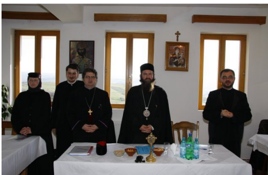
Fig. 1. The partnership with the Diocese of Maramureș and Sătmar